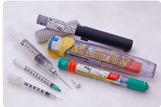
Examples of medical sharps.

They can injure people and may contain biohazards that spread infections that cause serious health conditions.